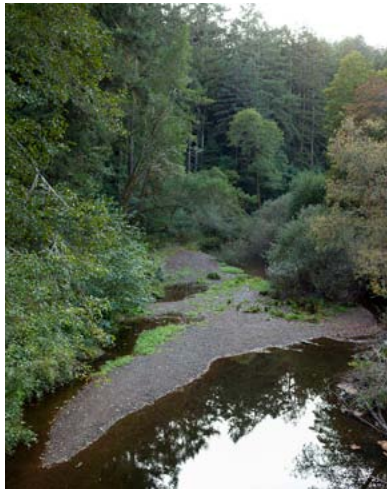
Tomales Bay State Park.

State parks are one such area. Logical targets were supposedly under-utilized properties, especially those in areas with fewer voters. By and large, southern beach parks were spared, Northern California venues were not. In Marin, Tamalpais, Tomales Bay, Olompali, and Samuel Taylor parks were all scheduled for closure.