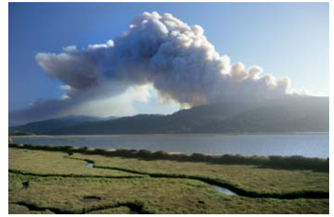
Mount Vision Fire-17 years ago.

standing rules about defensible space around dwellings. They are also concerned about thickets of dead trees and brush on unimproved properties—a worsening problem because of sudden oak death. If you get one of those letters, please don't ignore it.