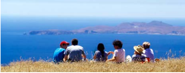
Group of Hikers on Mt. Wittenburg

Their web site is http://www.ptreyes.org . It is easy to forget what we owe to the presence of the national seashore. Without it, we'd have either ticky-tacky, or toney gated communities up and down our coast. PRNSA exists to do things that the park could not do on its own, like restoring tidal flows to upper Tomales Bay.